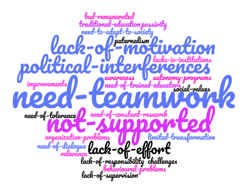
Figure 6.4. Visions on educative system (Ideally)