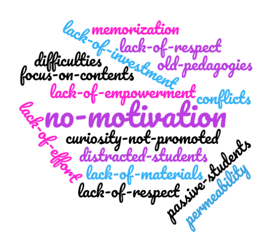
Figure 5.4: Visions on educative system (ideally)