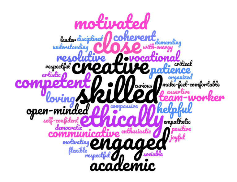
Figure 5.6: Students' qualities