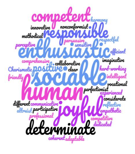
Figure 5.2: Nuria's promotion of REM values